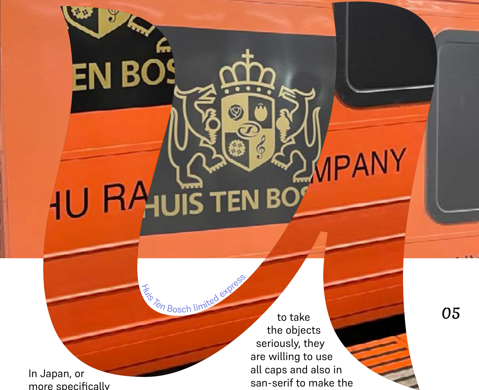
Huis Ten Bosch limited express