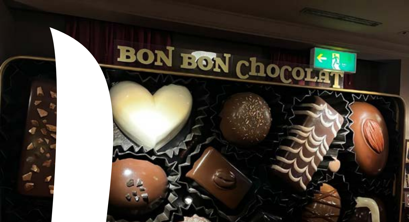
Count Chocolat's Mansion in Fukuoka Huis Ten Bosch