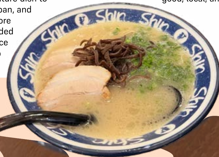
Ramen noodle soup in ShinShin KITTE Hakata

Apart from reminding the customers about the signature dish of Japan, using such strong connection with traditional rounded shape typeface style brings a great concept to the customers that they are cooking a traditional ramen noodle soup instead of some fusion style. That gives the audience like travellers a good impression that it can persuade the customers their ramen is good, local, and traditional.